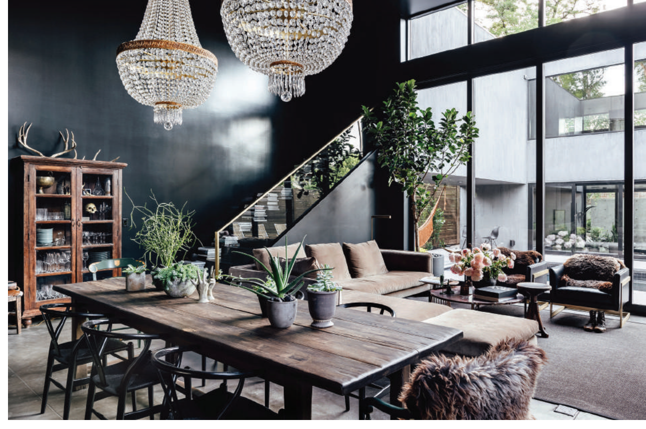
The homeowner made a determined effort to find pendant lights that could handle the scale of the double-height living and dining space.

For Derrick, "home" has always represented a "commitment to create solace, beauty and creative sovereignty." In this house, he opted to dress the interiors in a dark color scheme. To balance for a relatively small home, and the double-height great room is a that, describes Sparano, "We developed the architecture to illuminate the spaces carefully through precisely located windows and While a strong sense of enclosure defines this long, linear box of a connections to the outdoors at the front of the home, the center courtyard and the back garden spaces."