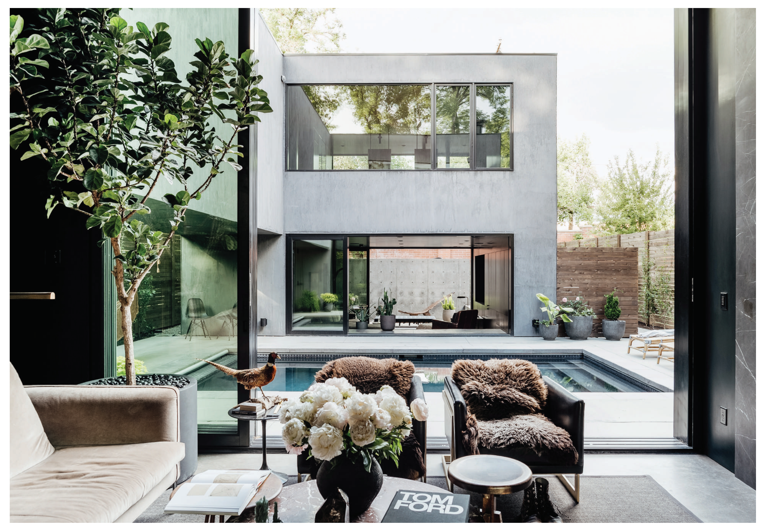
A view from the main living space to the pool house, which includes a den and a guest suite.