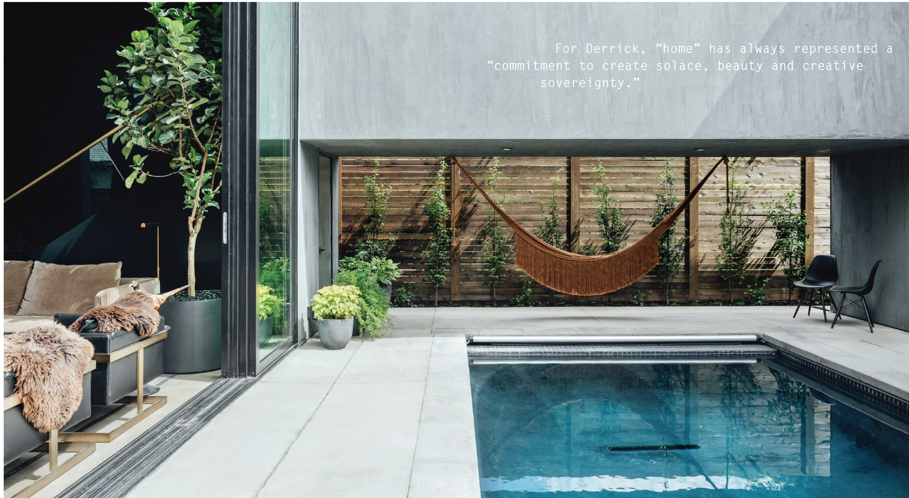
Nestled between the two primary volumes of the house, the small pool area is a true oasis.