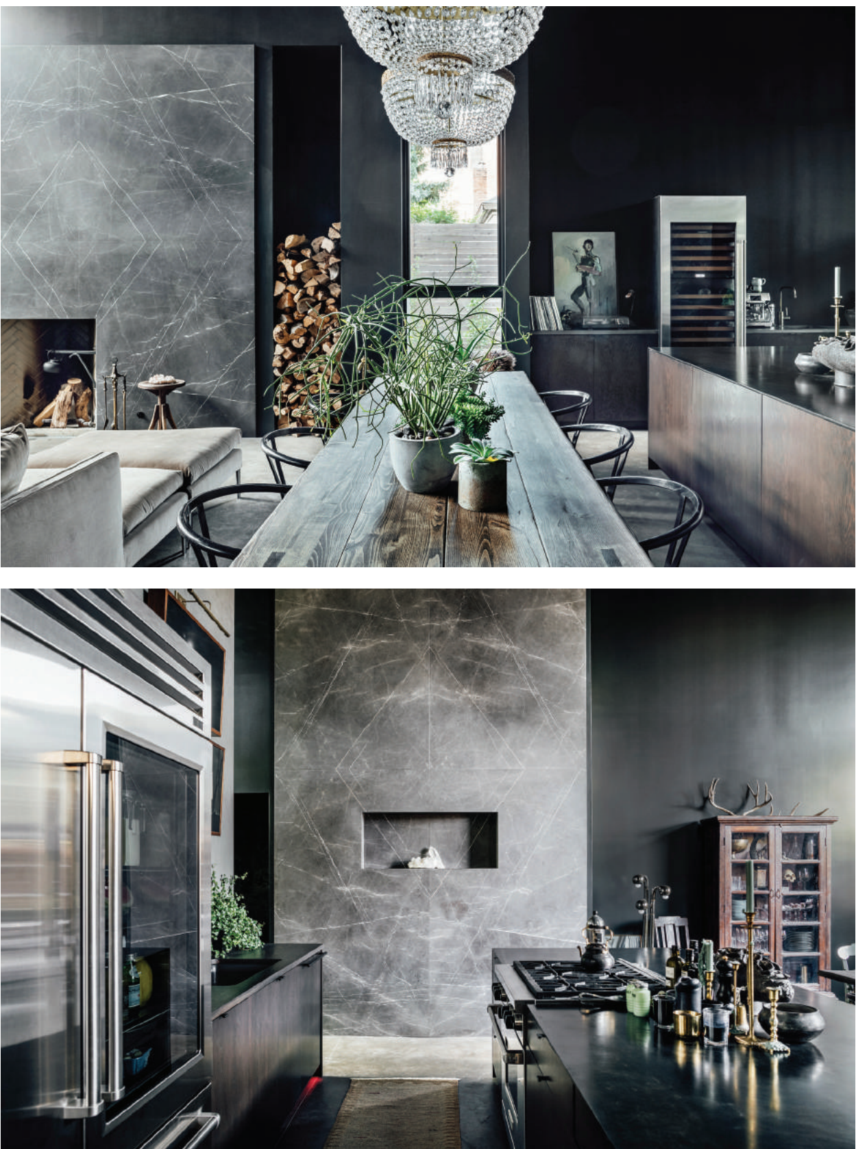
The living and dining areas are enveloped in Carriage Green by Farrow & Ball. A single piece of cold rolled steel covers the kitchen. The vertical element - covered in Graphite marble - conceals a utility closet.

Taking their client's lead, principals John Sparano and Anne Mooney fashioned a one-bedroom, 2,000-square-foot residence that features an open-plan living space, a small pool surrounded by a patio and a separate guest suite. "This is a tight site with significant restrictions, so we maximized the building envelope within what was allowed," shares Mooney, "providing moments of expansion and compression you experience as you move through the spaces. For example, the oversized porch and entry provide a grand entrance wonderful contrast to the more intimately scaled bedroom."